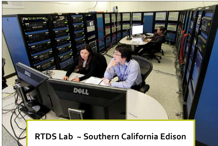
RTDS Lab ~ Southern California Edison

Southern California Edison (SCE), one of the largest electric utilities in California, has recently expanded their RTDS real-time power system simulator to 20 racks using the latest generation of processor cards. The expanded RTDS is housed in SCE's new