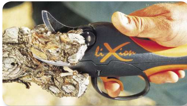
LiXion (pruning shear)